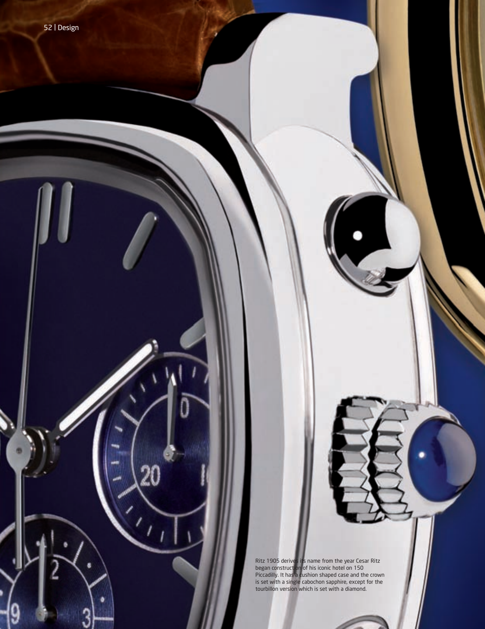
Ritz 1905 derives its name from the year Cesar Ritz began construction of his iconic hotel on 150 Piccadilly. It has a cushion shaped case and the crown is set with a single cabochon sapphire, except for the tourbillon version which is set with a diamond.